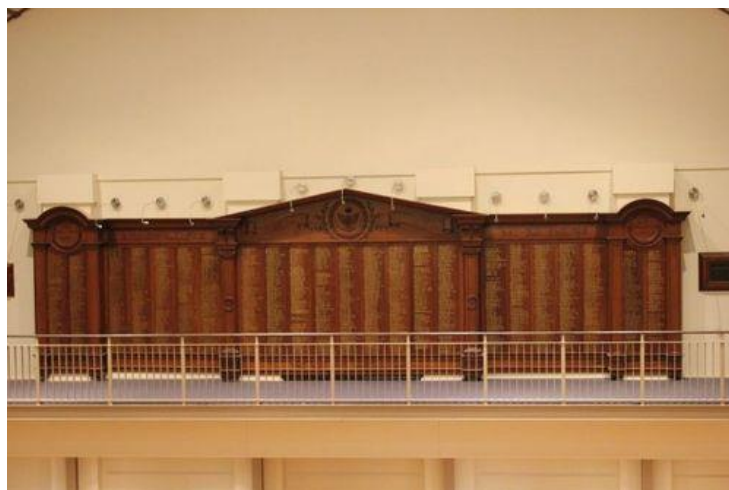
Unley City Honour Roll

C. G. French is remembered on the Unley City Honour Roll, located at Town Hall, Unley Road & Oxford Terrace, Unley, South Australia.